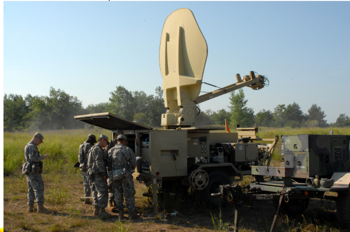
" Soldiers of the 101st Signal Battalion operate a Satellite Transportable Terminal (STT) during training at Fort Hood, Texas before departure to the Middle East.